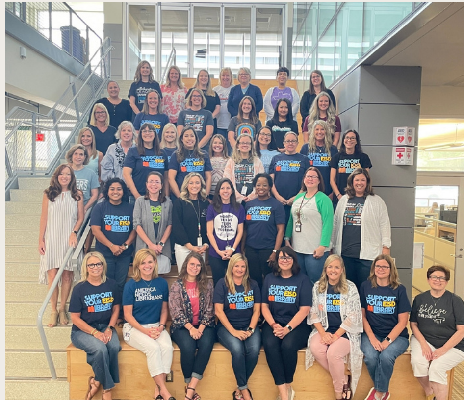
Elementary School Librarians