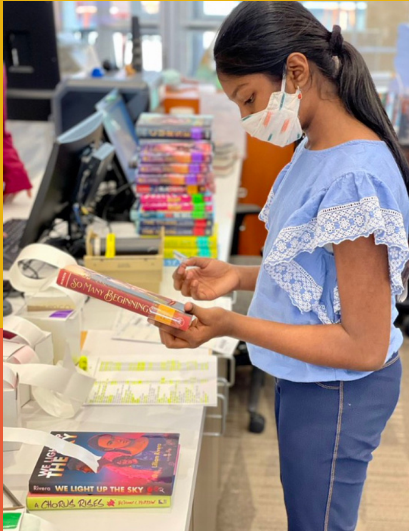
Love of literacy