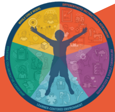
Future Ready Framework