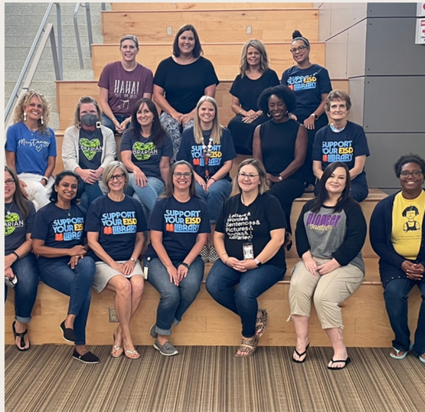
Middle School Librarians