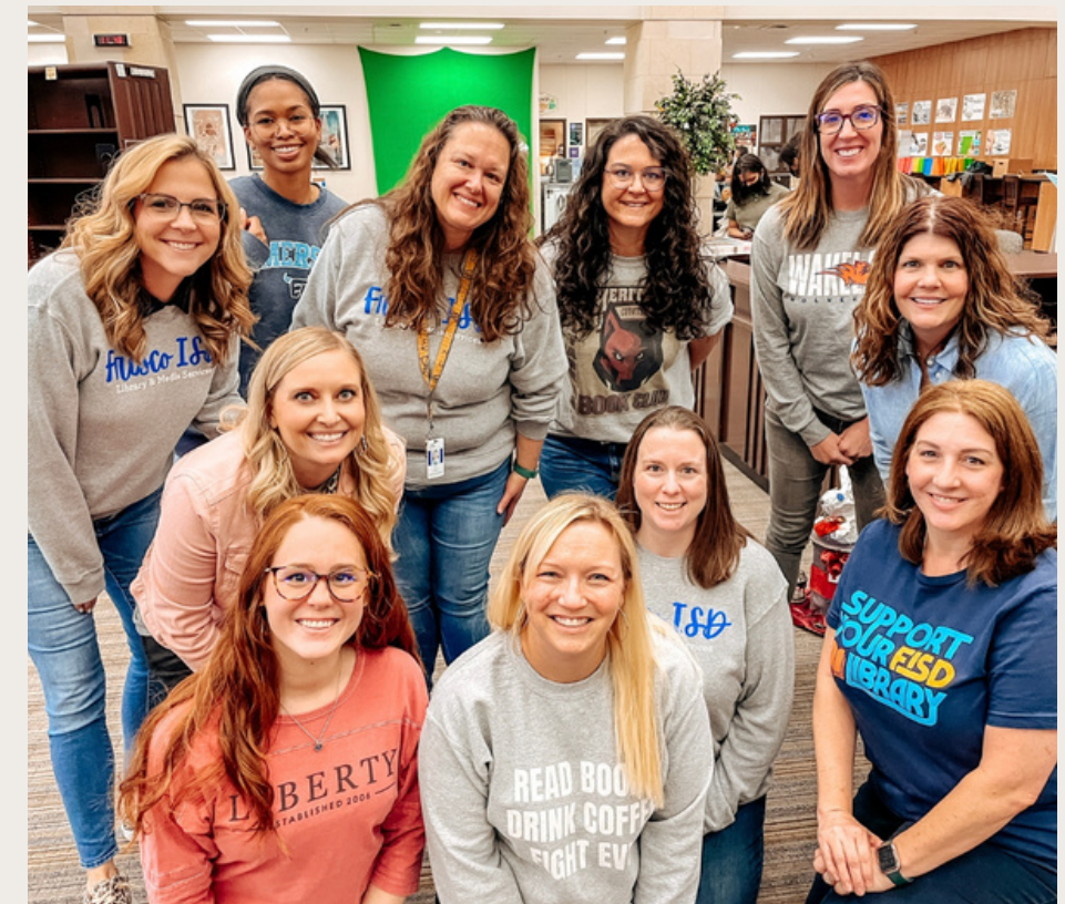
High School Librarians