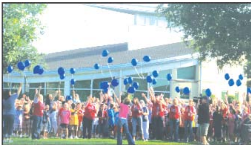
A New Blue Tradition! Curtsinger teachers, staff, students, and parents enjoyed a beautiful blue balloon release to commemorate Curtsinger's Blue Ribbon School distinction.