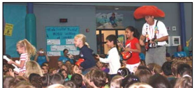
Morris Brothers program "Bully Busters".