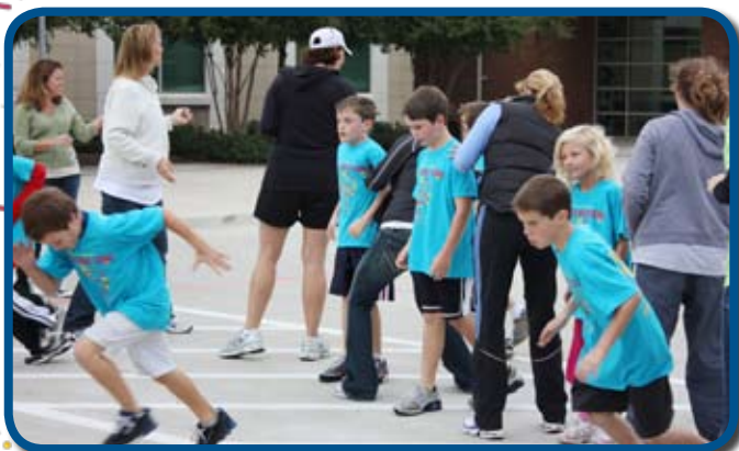
Parents and teachers make sure Third Grade runners and walkers get their laps marked