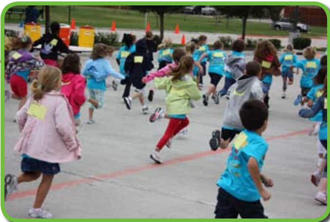
And the First Graders are OFF!