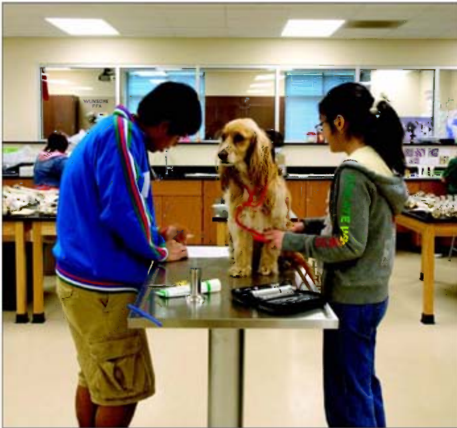
The Frisco ISD Career Tech Center allows students to study veterinary science in a specially appointed portion of the facility.

Hollywood animation studios. Students interested in crime scene investigation (CSI) can take one of several courses under the Legal Studies career pathway. More importantly, they can perform lab studies related to the course material using many of the same methods that forensic scientists use today.