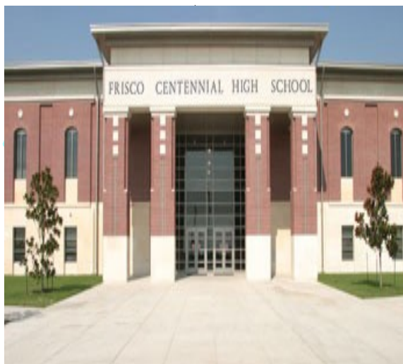
Façade of Centennial High School.

English 1-4, Algebra II, Geometry, Pre-Calculus, Calculus AB and BC, Statistics, Biology, Chemistry, US History, World Geography, Human Geography, World History, Government, Environmental Science, European History, Macro-economics, German, Spanish Language and Literature, French, Psychology, Music Theory, Studio Art, Art History, Physics B and C and Computer Science A and AB.