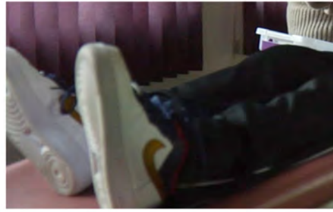
2 Feet out straight