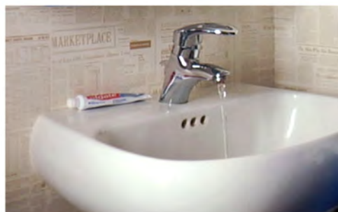
8 Spit into sink